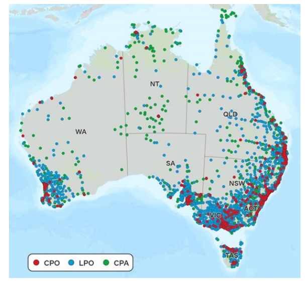
Figure 2. Post office network throughout Australia<sup>2</sup>

<sup>1</sup> Australia Post network and transport fleet figures are as at 30 June 2020. Parcel lockers include those located at third party (eg Woolworths) sites, and airline freighters refer to leased freighters from Qantas. <sup>2</sup> ArcGIS mapping as at 30 June 2019