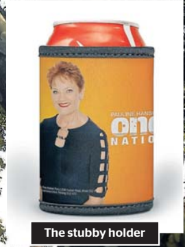
The stubby holder