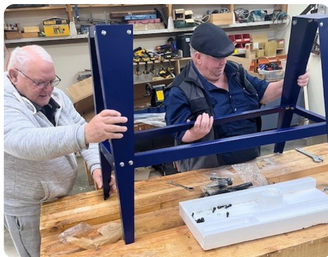
Picture: Group members of the Rochester Community House setting up the new equipment